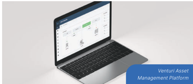
Venturi Asset Management Platform

Provides a single pane of glass view across fleets, facilities, and geographies.