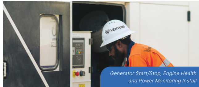
Generator Start/Stop, Engine Health and Power Monitoring Install

Are based in country, ensuring you have highly-trained local support when it's needed and superior installation quality.