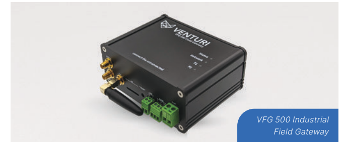
VFG 500 Industrial Field Gateway

Has been designed to withstand the rigours of industrial worksites.